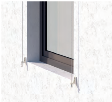
Wire rope guides