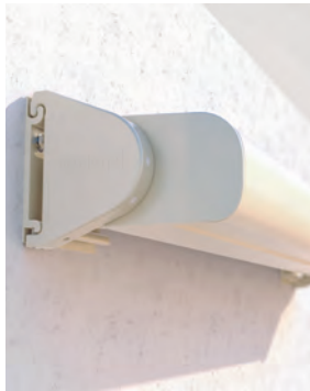
Round or square design