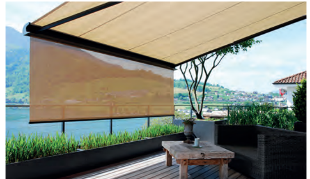
Drop down valance