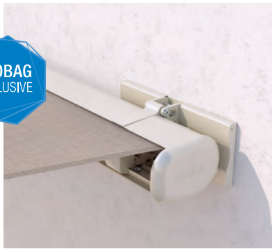
Patented box connection