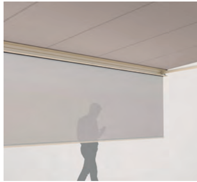
Drop down valance