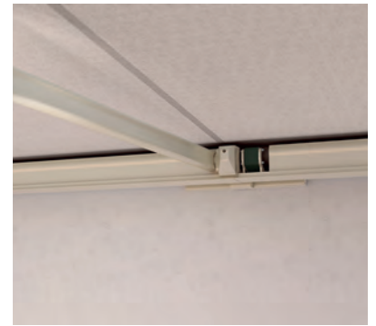
Roller tube blind