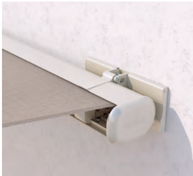
Patented box connection